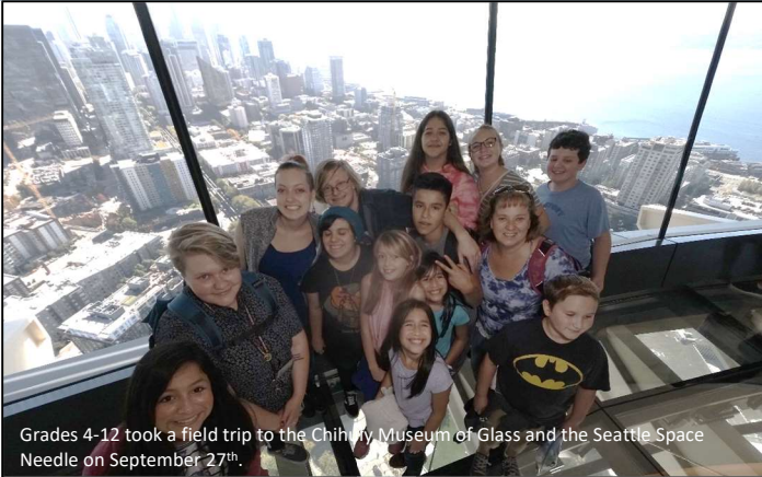
Grades 4-12 took a field trip to the Chihuly Museum of Glass and the Seattle Space Needle on September 27 th .

EVERYONE SUCCEEDS. NO EXCEPTIONS. NO EXCUSES